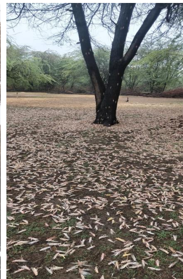
Desert locust havoc at Rajasthan